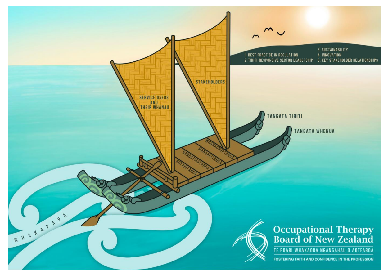
Waka hourua

OTBNZ has been working alongside Te Ropū Tohutohu to have a shared understanding of how the organisation can give effect to te Tiriti o Waitangi. Here, we describe a waka hourua (double-hull canoe) travelling and navigating the oceans as a metaphorical framework for the journey we are commencing and the development of collaborative initiatives.